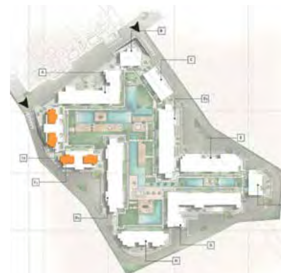
Type H / Penthouse Locations

DISCLAIMER: All materials, dimensions and drawings are approximate. Information is subject to change without notice. Drawings are not to scale and actual usable floor space may vary from the state floor plans. The developer reserves the right to make revisions to the floor plans. All displayed garden and terrace areas vary according to unit locations in buildings and according to the project layout.