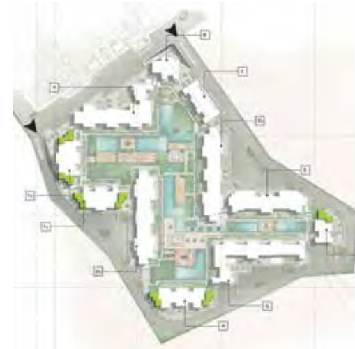
Type B / Garden Locations