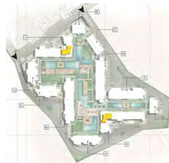
Type C / Penthouse Locations

DISCLAIMER: All materials, dimensions and drawings are approximate. Information is subject to change without notice. Drawings are not to scale and actual usable floor space may vary from the state floor plans. The developer reserves the right to make revisions to the floor plans. All displayed garden and terrace areas vary according to unit locations in buildings and according to the project layout.