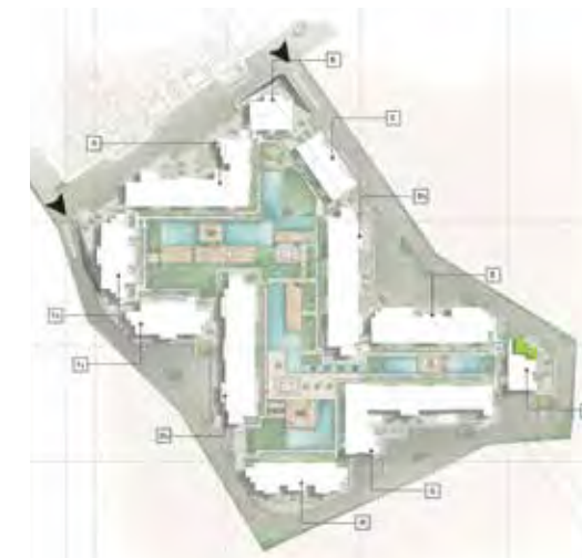
Type B / Penthouse Locations

DISCLAIMER: All materials, dimensions and drawings are approximate. Information is subject to change without notice. Drawings are not to scale and actual usable floor space may vary from the state floor plans. The developer reserves the right to make revisions to the floor plans. All displayed garden and terrace areas vary according to unit locations in buildings and according to the project layout.