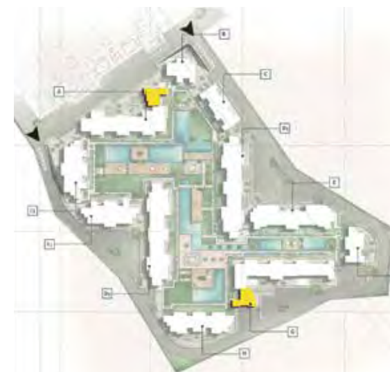
Type B / Garden Locations