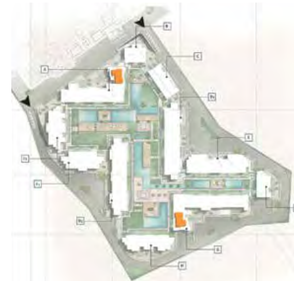
Type C / Penthouse Locations