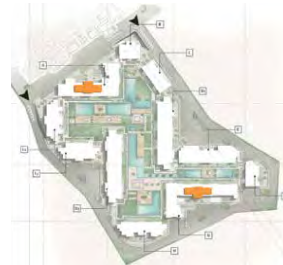
Type B / Penthouse Locations