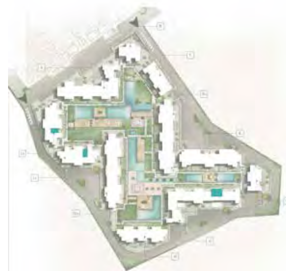
Type C / Penthouse Locations

DISCLAIMER: All materials, dimensions and drawings are approximate. Information is subject to change without notice. Drawings are not to scale and actual usable floor space may vary from the state floor plans. The developer reserves the right to make revisions to the floor plans. All displayed garden and terrace areas vary according to unit locations in buildings and according to the project layout.