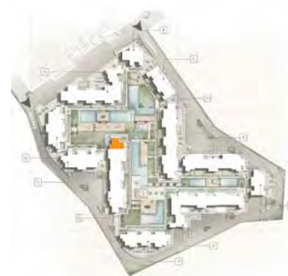
Type L / Penthouse Locations