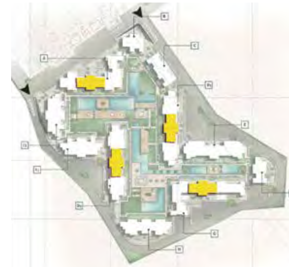
Type A / Garden Locations

DISCLAIMER: All materials, dimensions and drawings are approximate. Information is subject to change without notice. Drawings are not to scale and actual usable floor space may vary from the state floor plans. The developer reserves the right to make revisions to the floor plans. All displayed garden and terrace areas vary according to unit locations in buildings and according to the project layout.