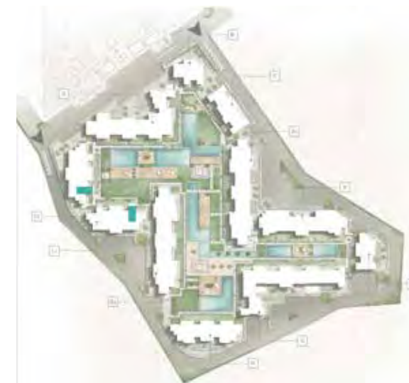
Type E / Penthouse Locations

DISCLAIMER: All materials, dimensions and drawings are approximate. Information is subject to change without notice. Drawings are not to scale and actual usable floor space may vary from the state floor plans. The developer reserves the right to make revisions to the floor plans. All displayed garden and terrace areas vary according to unit locations in buildings and according to the project layout.