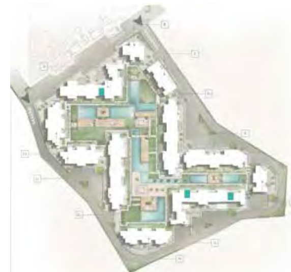
Type B / Executive Locations

DISCLAIMER: All materials, dimensions and drawings are approximate. Information is subject to change without notice. Drawings are not to scale and actual usable floor space may vary from the state floor plans. The developer reserves the right to make revisions to the floor plans. All displayed garden and terrace areas vary according to unit locations in buildings and according to the project layout.