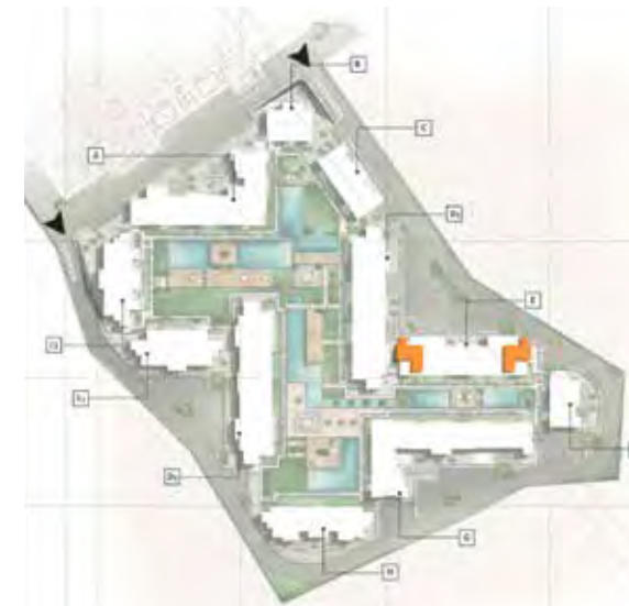
Type J / Penthouse Locations