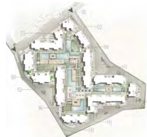
Type E / Penthouse Locations

DISCLAIMER: All materials, dimensions and drawings are approximate. Information is subject to change without notice. Drawings are not to scale and actual usable floor space may vary from the state floor plans. The developer reserves the right to make revisions to the floor plans. All displayed garden and terrace areas vary according to unit locations in buildings and according to the project layout.