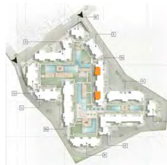
Type E / Garden Locations