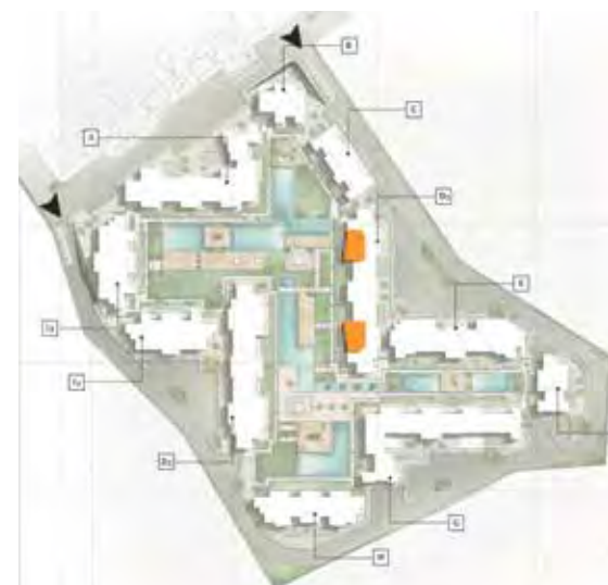
Type E / Executive Locations

DISCLAIMER: All materials, dimensions and drawings are approximate. Information is subject to change without notice. Drawings are not to scale and actual usable floor space may vary from the state floor plans. The developer reserves the right to make revisions to the floor plans. All displayed garden and terrace areas vary according to unit locations in buildings and according to the project layout.