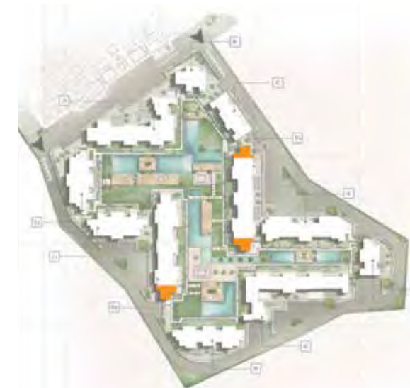
Type G / Penthouse Locations