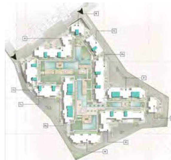
Type A / Executive Locations

DISCLAIMER: All materials, dimensions and drawings are approximate. Information is subject to change without notice. Drawings are not to scale and actual usable floor space may vary from the state floor plans. The developer reserves the right to make revisions to the floor plans. All displayed garden and terrace areas vary according to unit locations in buildings and according to the project layout.