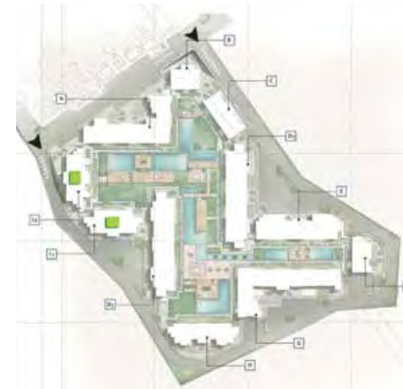
Type C / Penthouse Locations