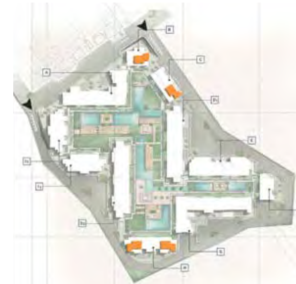
Type F / Penthouse Locations