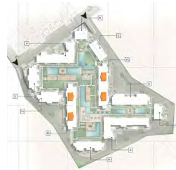
Type K / Penthouse Locations