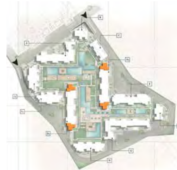
Type D / Garden Locations