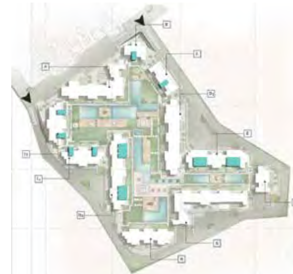
Type A / Garden Locations